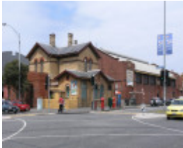
NAVAL DRILL HALL AND FORMER POST OFFICE SOHE 2008