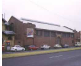
1 naval drill hall side view oct1997