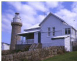
1 wilsons prom lightstation tower and headkeepers quarters aug 99