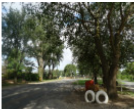
4957_Bacchus Marsh Avenue of Honour_25 December 2009_HV_048.JPG