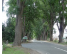
4957_Bacchus Marsh Avenue of Honour_25 December 2009_HV_039.JPG