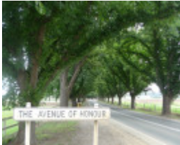
4957_Bacchus Marsh Avenue of Honour_25 December 2009_HV_019.JPG