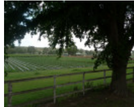
4957_Bacchus Marsh Avenue of Honour_25 December 2009_HV_020.JPG