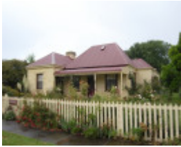
SEAFIELD SOHE 2008