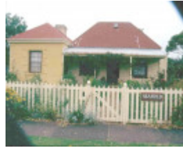
h02063 seafield dec 2003