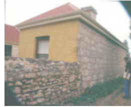
Seafield December 2003