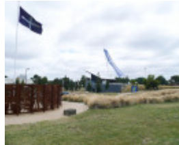
EUREKA HISTORIC PRECINCT SOHE 2008