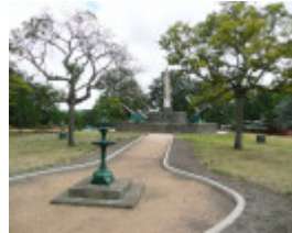
EUREKA HISTORIC PRECINCT SOHE 2008