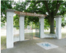
EUREKA HISTORIC PRECINCT SOHE 2008