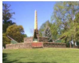
1 eureka monument view nov1999 db