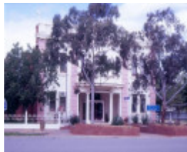
h01905 soldiers and citizens memorial hall jeparit front view she project 2004