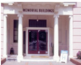
h01905 soldiers and citizens memorial hall jeparit front entrance she project 2004