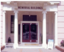
h01905 soldiers and citizens memorial hall jeparit front entrance she project 2004