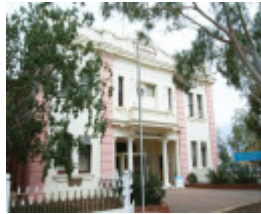
SOLDIERS' AND CITIZENS' MEMORIAL HALL AND FORMER MUNICIPAL CHAMBERS SOHE 2008