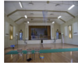
SOLDIERS' AND CITIZENS' MEMORIAL HALL AND FORMER MUNICIPAL CHAMBERS SOHE 2008