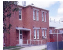
h01905 soldiers and citizens memorial hall jeparit rhs building she project 2004