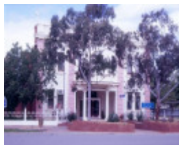
h01905 soldiers and citizens memorial hall jeparit front view she project 2004