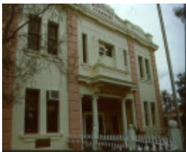
Jeparit Hall Front August 2000