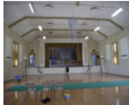
SOLDIERS' AND CITIZENS' MEMORIAL HALL AND FORMER MUNICIPAL CHAMBERS SOHE 2008