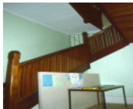
Jeparit Town Hall Staircase August 2000