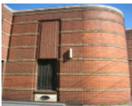
11488 Royal Melbourne Regiment Drill Hall Exterior Detail 01 11 Sept 2006 mz