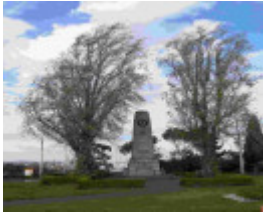
Williamstown War Memorial, Hobsons Bay Heritage Study 2006