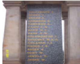
23457 Dunkeld War Memorial 0144