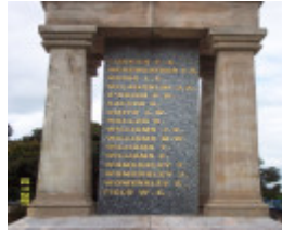
23457 Dunkeld War memorial 0142