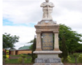
23457 Copy of 0397 Dunkeld War memorial