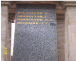
23457 Dunkeld War memorial 0143