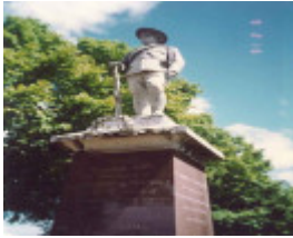
26784 Empire War Memorial