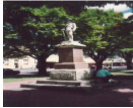
26784 Empire War Memorial 02