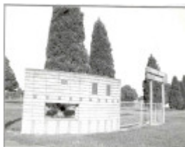
26949 Barwon Heads Road South Barwon Reserve Memorial Photo