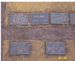
23634 Cavendish Memorial Park 0128