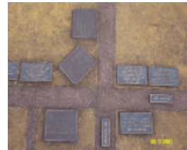
23634 Cavendish Memorial Park 0127