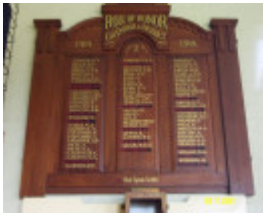
23634 Cavendish Memorial Hall 0138