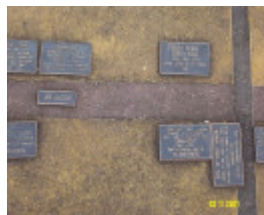
23634 Cavendish Memorial Park 0129