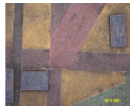
23634 Cavendish Memorial Park 0130