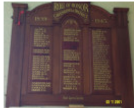
23634 Cavendish Memorial Hall 0139