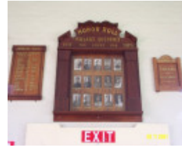
23634 Cavendish Memorial Hall 0137