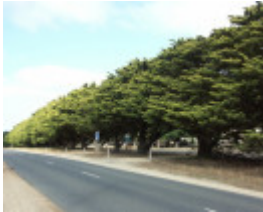
Avenue of Honour.