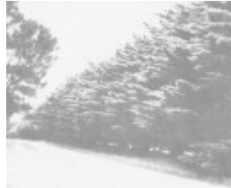
Avenue of Honour showing mature cypresses, 1996.