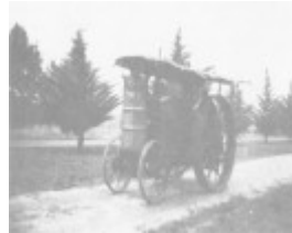
Avenue of Honour showing young cypresses, c.1959.