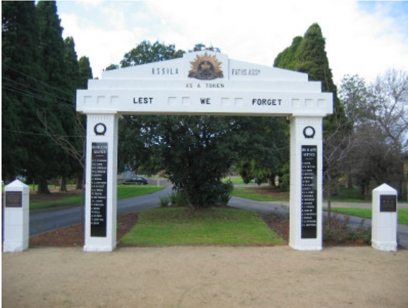
29405 Memorial Arch 1 Walnut Street Whittlesea 25