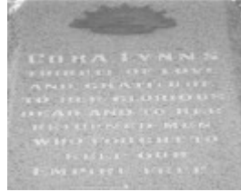
Cora L 2.jpg