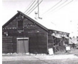
Diggers Rest, November 1945. The exterior of the old 'shack' at Diggers Rest, used by Land Headquarters Signals to house transmitters. This would have been one of the converted farm buildings.