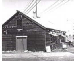
Diggers Rest, November 1945. The exterior of the old 'shack' at Diggers Rest, used by Land Headquarters Signals to house transmitters. This would have been one of the converted farm buildings.