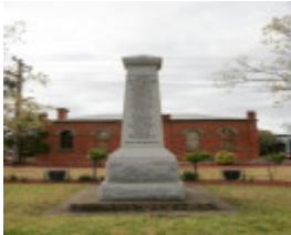
Melton War Memorial.jpg