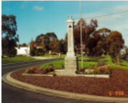
Toora World War 1 Soldiers' Memorial