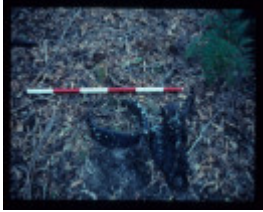
THOMPSON BROTHERS' SAWMILL