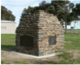
WW1 and WW2 Memorial Wallinduc