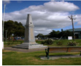
32350 Longwarry War mem