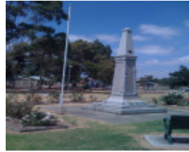
32350 longwarry war memorial