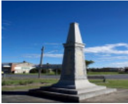
Longwarry War Memorial.jpg