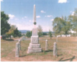
WW1 Memorial, Tylden 1990