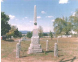
WW1 Memorial, Tylden 1990