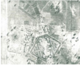
Aerial view of Rushworth camp 3 (European internees, 1940-6)