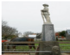
Beeac War Memorial.jpg