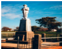
45003 WAR MEMORIAL