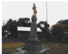
War Memorial, 2001