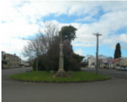
62190 I War Memorial High St Lancefield