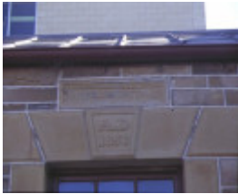
specimen cottage hargraves street bendigo facade detail