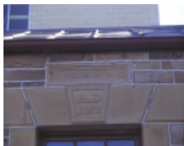
specimen cottage hargraves street bendigo facade detail