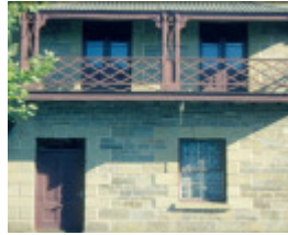
cottages hargraves street bendigo close up view