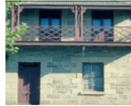
cottages hargraves street bendigo close up view