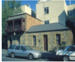
h01615 1 cottages hargraves street bendigo front view