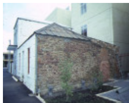
cottages hargraves street bendigo side view specimen cottage jul1984