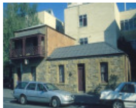
h01615 1 cottages hargraves street bendigo front view