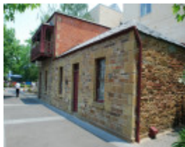
SPECIMEN COTTAGE SOHE 2008