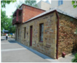
SPECIMEN COTTAGE SOHE 2008