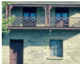
cottages hargraves street bendigo close up view