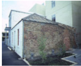
cottages hargraves street bendigo side view specimen cottage jul1984