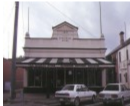
1 purcells general store high street yea front view apr1989