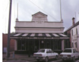
1 purcells general store high street yea front view apr1989