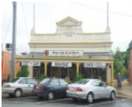
PURCELLS GENERAL STORE SOHE 2008