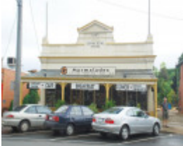
PURCELLS GENERAL STORE SOHE 2008