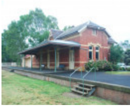
FORMER YEA RAILWAY STATION SOHE 2008