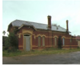
1 former yea railway station station street yea front view