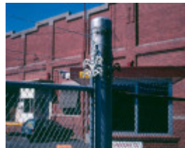
h02031 preston tramway workshops fence detail may03 aj