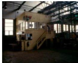
h02031 preston tramway workshops int foreman s office may03 aj