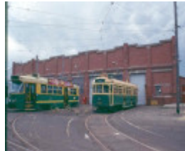
h02031 1 preston tramway workshops ext paint shop may03 aj