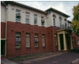
h02031 preston tramway workshops admin building may03 aj