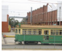
PRESTON TRAMWAY WORKSHOPS SOHE 2008