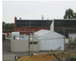
PRESTON TRAMWAY WORKSHOPS SOHE 2008