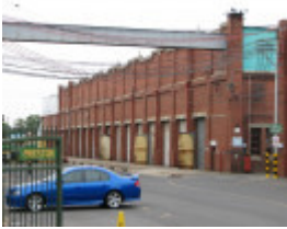
PRESTON TRAMWAY WORKSHOPS SOHE 2008