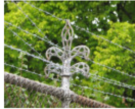
PRESTON TRAMWAY WORKSHOPS SOHE 2008