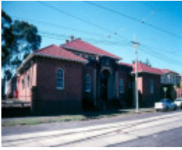
h02031 preston tramway workshops mess complex may03 aj