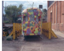
h02031 preston tramway workshops car straightening bay may03 aj