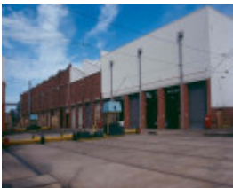
h02031 preston tramway workshops ext body shop may03 aj