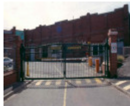
h02031 preston tramway workshops entry gates may03 aj