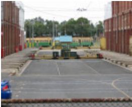
PRESTON TRAMWAY WORKSHOPS SOHE 2008