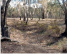
H02017 camerons saw mill site