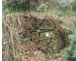
H02015 wheelers tramway retaining wall