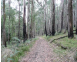
WHEELER'S TRAMWAY SOHE 2008