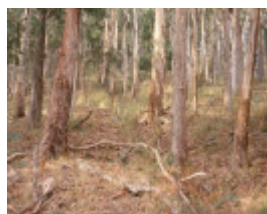
H02018 kozminskys mill and log chute chute