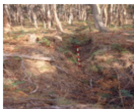
H02018 kozminskys mill and log chute mill site