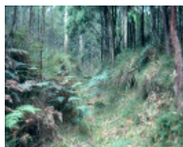
H02022 barbours tramway