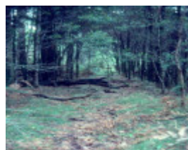
H02022 barbours log chute