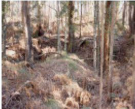
H02016 telegraph graves sawmill