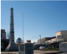
Warragul War Memorial.jpg