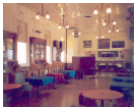
1_h02044 lilydale railway station refreshment room5