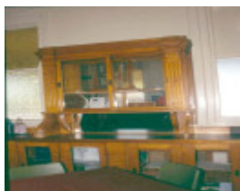
h02044 lilydale railway station refreshment rooms3