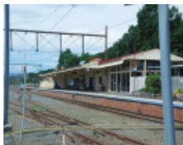
LILYDALE RAILWAY STATION REFRESHMENT ROOMS SOHE 2008