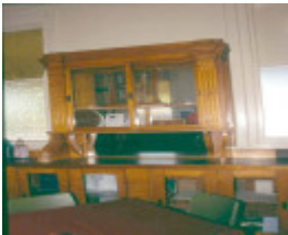
h02044 lilydale railway station refreshment rooms3