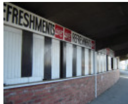
h00075 victoria park abbotsford june05 rush stand snackbar