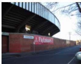
h00075 victoria park abbotsford june05 sherrin stand lylie street2