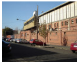
h00075 victoria park abbotsford june05 abbot street longview