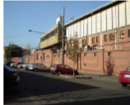
h00075 victoria park abbotsford june05 abbot street longview