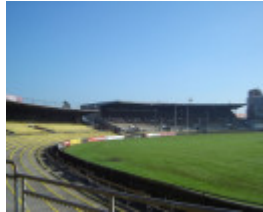
h00075 1 victoria park abbotsford june05 rush stand sherrin stand