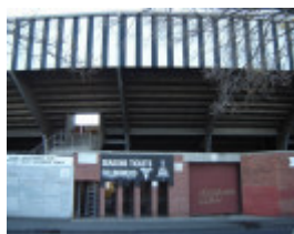
H0075 Victoria park abbotsford June05 Sherrin stand lylie street