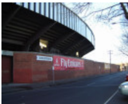
h00075 victoria park abbotsford june05 sherrin stand lulie street2