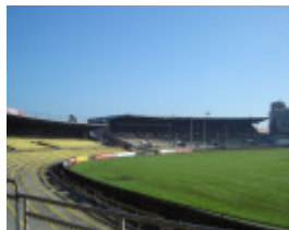
h00075 1 victoria park abbotsford june05 rush stand sherrin stand