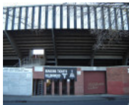
H0075 Victoria park abbotsford June05 Sherrin stand lulie street