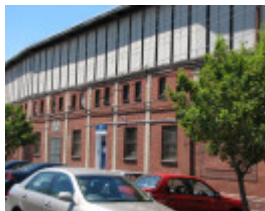
VICTORIA PARK SOHE 2008