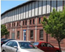
VICTORIA PARK SOHE 2008