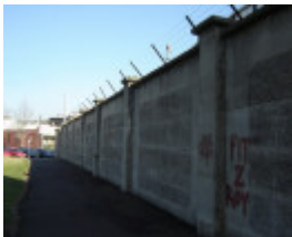
h00075 victoria park abbotsford june05 bath street concrete wall