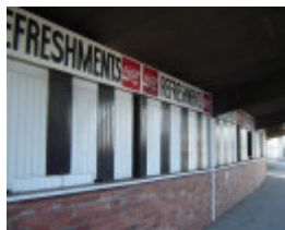
h00075 victoria park abbotsford june05 rush stand snackbar