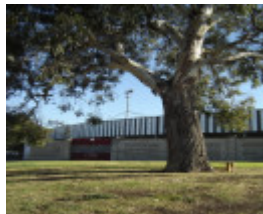
h00075 victoria park abbotsford june05 bath street reserve tree