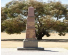
Cheltenham Boer War Memorial.jpg