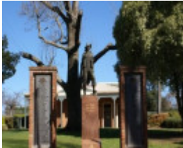
Drouin War memorial.jpg