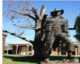
Drouin War Memorial 2.jpg