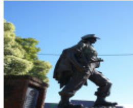
Drouin War Memorial 3.jpg