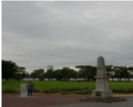
Hastings War Memorial.jpg