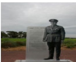
Ingram VC Memorial Hastings.jpg