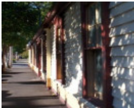
Copy of Richmond Gipps St 024 4580.JPG