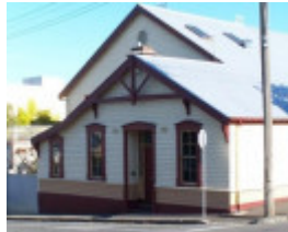
Copy of Richmond Gipps St 024 4570.JPG