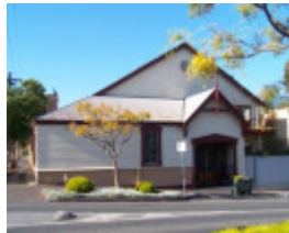
Copy of Richmond Gipps St 024 4575.JPG