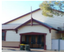
Copy of Richmond Gipps St 024 4579.JPG