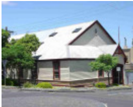
richmond gipps street richmond gipps street 24