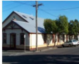
Copy of Richmond Gipps St 024 4571.JPG