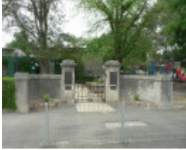
Scarsdale State School, 149 Scarsdale Pitfield Road Newtown