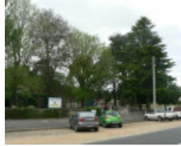
Scarsdale State School, 149 Scarsdale Pitfield Road Newtown