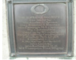
Scarsdale State School, 149 Scarsdale Pitfield Road Newtown