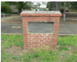
Scarsdale State School, 149 Scarsdale Pitfield Road Newtown