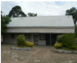
Scarsdale State School, 149 Scarsdale Pitfield Road Newtown