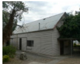
Scarsdale State School, 149 Scarsdale Pitfield Road Newtown