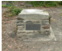
Scarsdale State School, 149 Scarsdale Pitfield Road Newtown