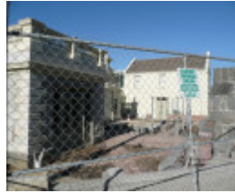
RANNOCH HOUSE SOHE 2008