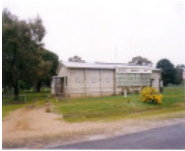
GL 01 - Shire of Northern Grampians - Stage 2 Heritage Study, 2004