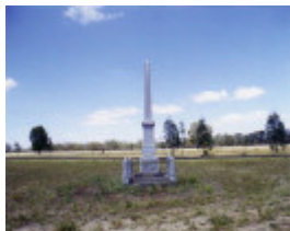
JJ 01 - Shire of Northern Grampians - Stage 2 Heritage Study, 2004