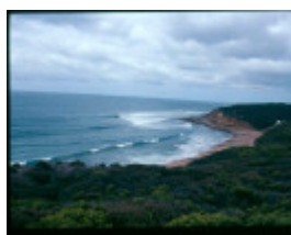
H02032 bells beach 3