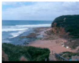
H02032 bells beach 2