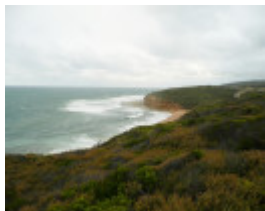
BELLS BEACH SURFING RECREATION RESERVE SOHE 2008