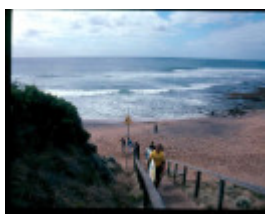
H02032 bells beach 1