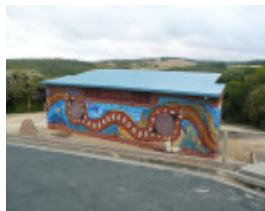
BELLS BEACH SURFING RECREATION RESERVE SOHE 2008