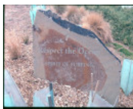
H02032 bells beach 4 spirit of surfing