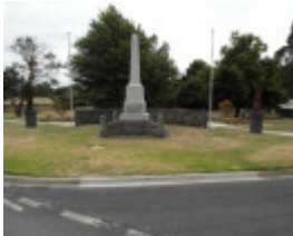
Kilmore war memorial.jpg