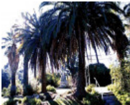
War Memorial and associated gardens