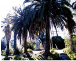
War Memorial and associated gardens