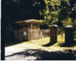
Swimming pool memorial gates